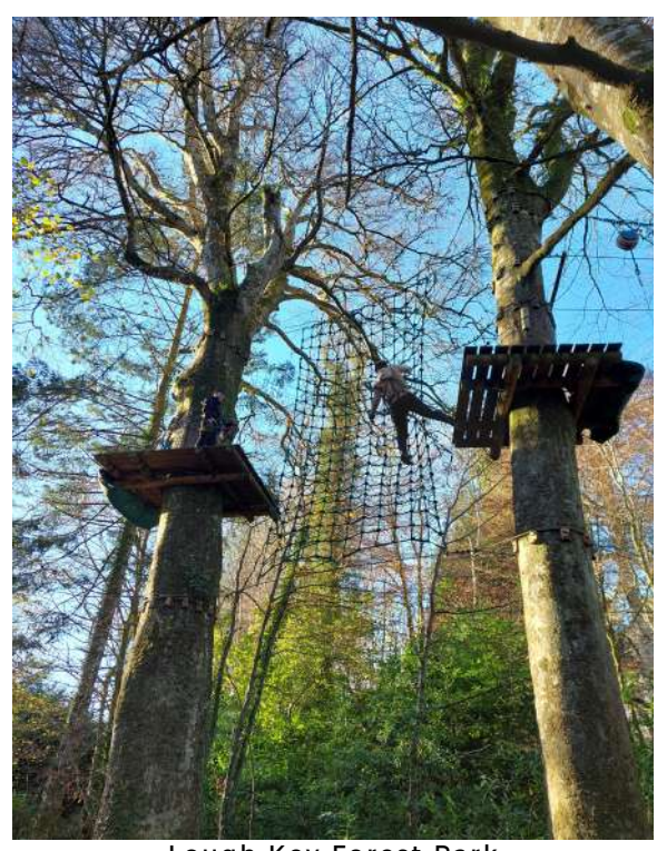
Lough Key Forest Park