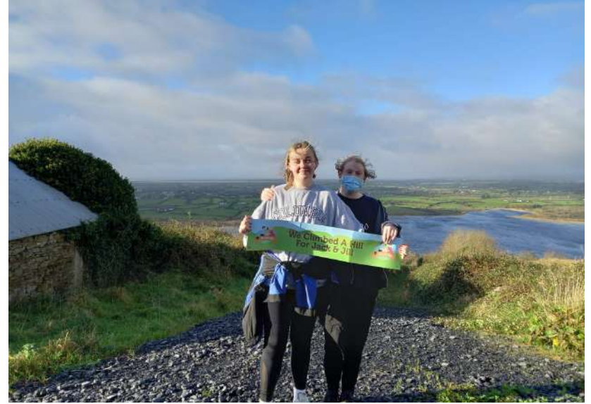
Jack and Jill Fundraiser 2021