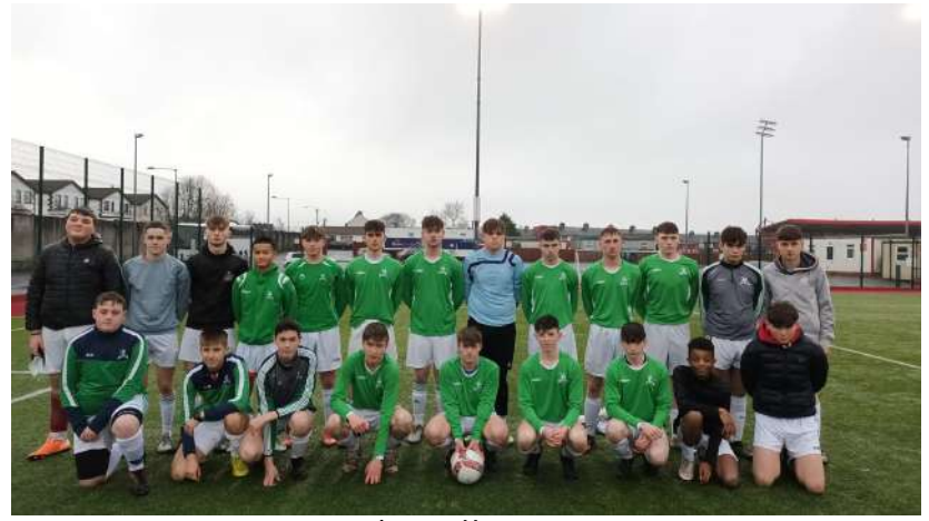
Davitt College U17s