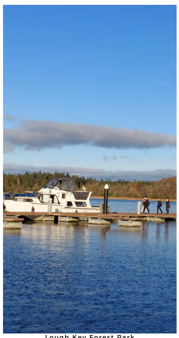
Lough Key Forest Park