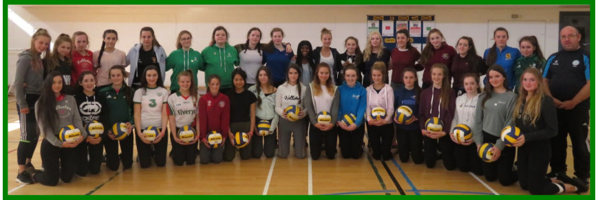
Davitt College Transition Year students enjoying the Spikeball Coaching Course in October 2017. The students will coach Spikeball in local Primary Schools throughout the coming months. Well done girls.

The Davitt College Sports Department has been a hive of activity during the first term. All teams are busy training during lunch time and after school. We have an extensive extra-curricular programme which caters for the sporting and leisure needs of the students in Davitt College. The provision of a wide range of extra-curricular activities makes an enormous contribution to the life of the school. The involvement in such activities complements the work that takes place in the classroom and gives the students an opportunity to develop their talents, social skills, and self-confidence and leadership qualities.