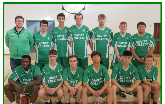
Davitt College U19 Boys Basketball Team