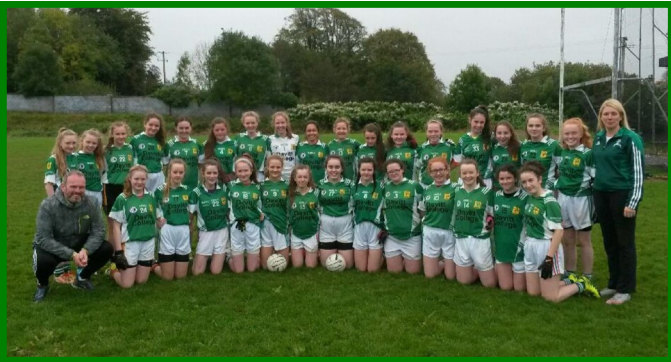
Davitt College Junior Girls Gaelic Team