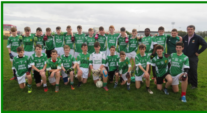
Davitt College Junior Boys Gaelic Team