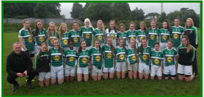
Davitt College Senior Girls Gaelic Team