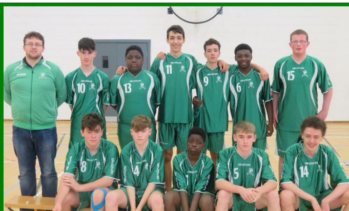
Davitt College U16 Boys Basketball Team