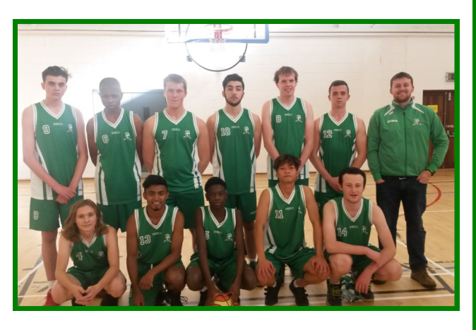
Davitt College U19 Boys Basketball Team