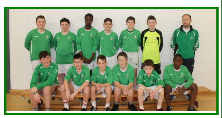
Davitt College First Year Boys Futsal Team